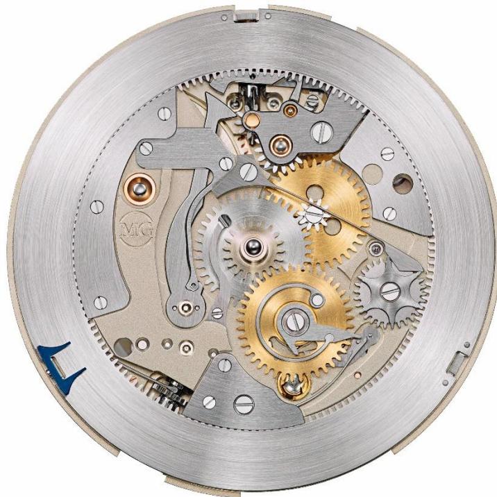
Calibre 100.3 dial side