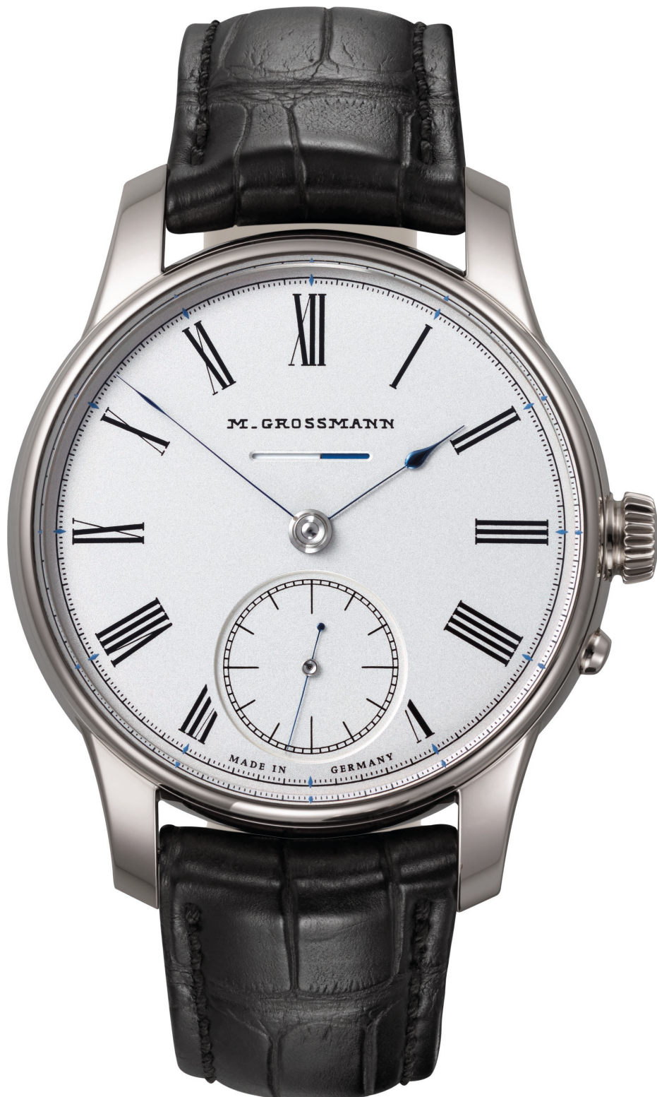
POWER RESERVE Vintage White Gold