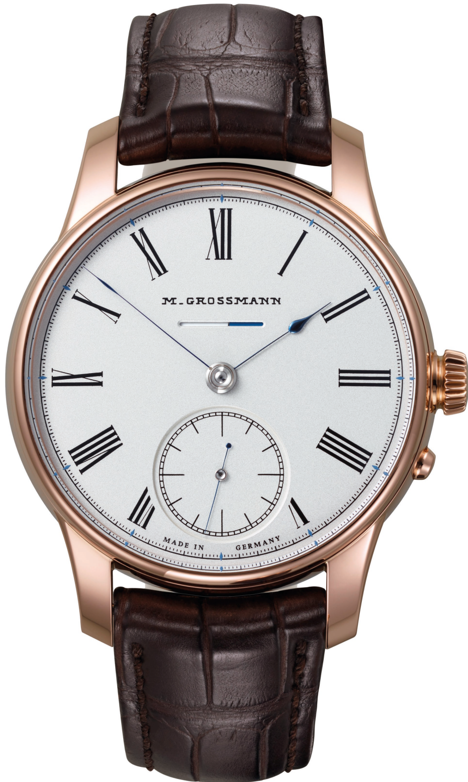
POWER RESERVE Vintage, Rose Gold